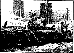
SOLD IN THE COLD..... It was a cold, muddy mess at the annual spring consignment farm auction at the Nelson sales barn between Westby and Coon Valley, on Tuesday, March 22.